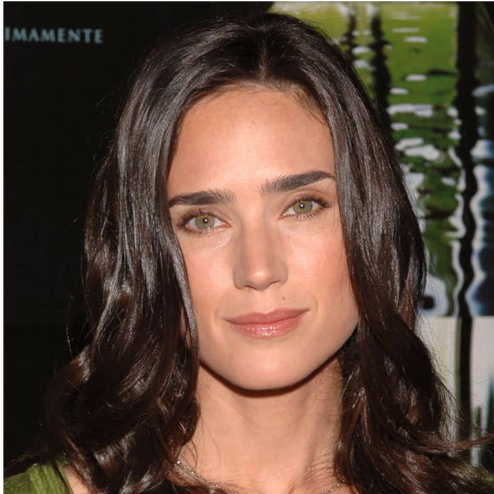
Jennifer Connelly in April 2014, aged 43